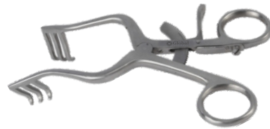
Self Retaining Mastoid Retractor