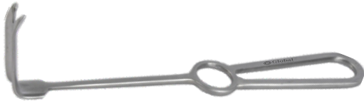
Condylar Alveolar Retractor