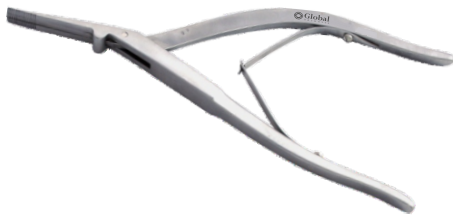
Superior Ramus Separater (Smith)