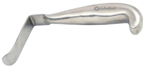
Ramus Retractor - Big Handle