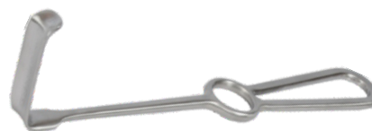
Soft Tissue Retractor - Concave Blade