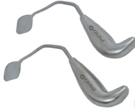
Rowe Orbital Floor Retractor Right & Left in Pair