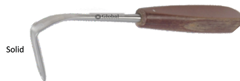
Aufricht Nasal Retractor