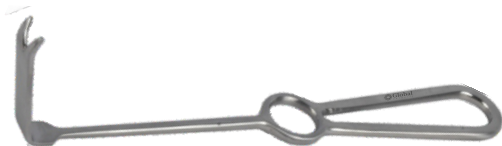
Forked Ramus Retractor