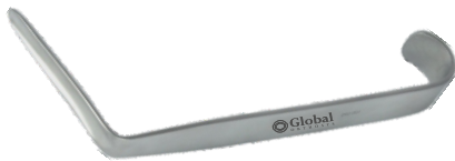
Kilner Nasal Retractor