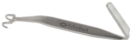
Aufricht Nasal & Double Hook Retractor