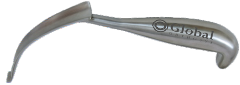
Rayne Mandibular Retractor