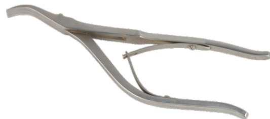
Universal Maxillary Spreader