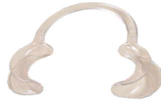
Plastic Cheek Retractor