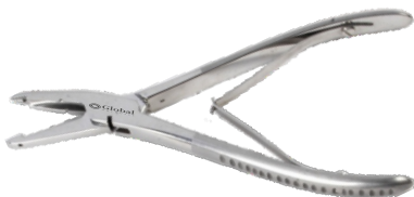
K Wire Bender/Cutter/Plier - 3 in 1