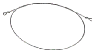
Gigli Saw Wire