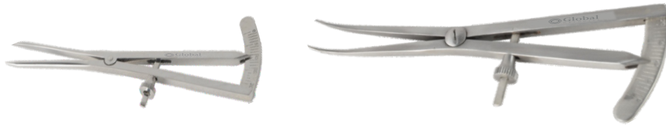
Calipers Castroviejo 20 mm