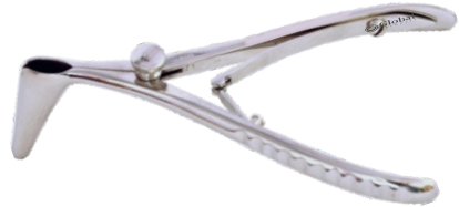
Killien Nasal Speculum