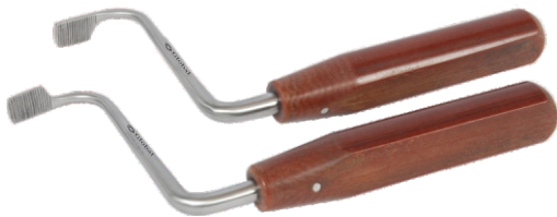
Tessier Maxillary Mobiliser Right & Left in Pair