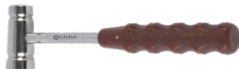
Fickling Dental Mallet