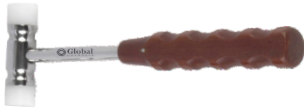
Nylon Faced Hammer