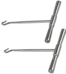
Gigli Saw Handle in Pair