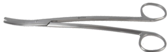
Scissors - Angular for Cleft Palate