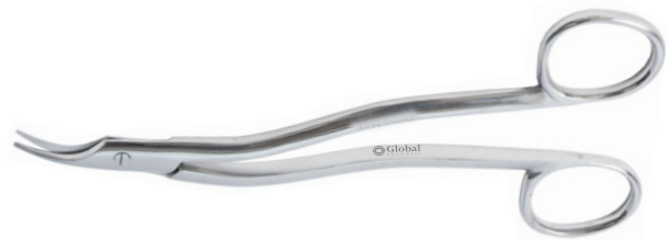
Scissors - "Heath" Stitch Cutting