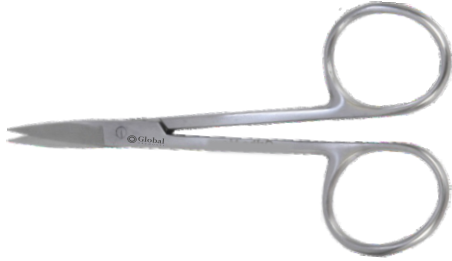
Scissors - Fine Irish Type