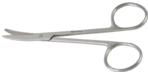
Scissors - "Northbent" Suture Cutting