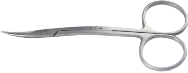
Scissors - Kilner