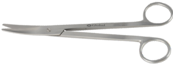
Scissors - Mayo