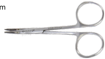
Scissors - Metzenbum