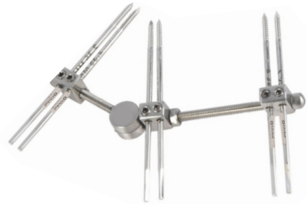
External Mandible Distractor Bi-Directional