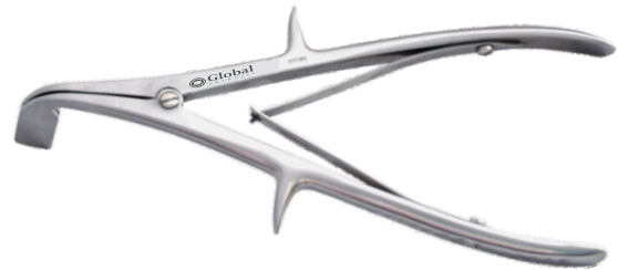
TMJ Spreading Forceps