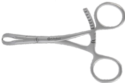
Reduction Bone Holding Forceps