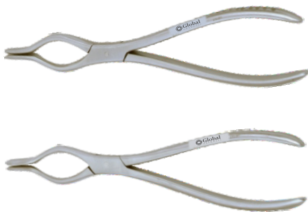
Walsham Nasal Septum Forceps