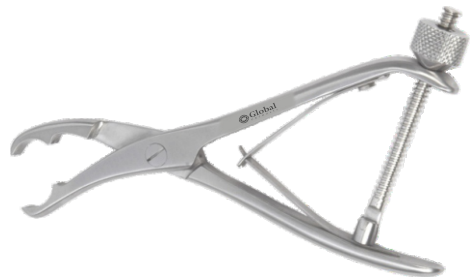
Bone (Mandible) Holding Forceps