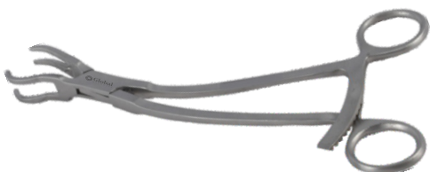
Mandibular Bone Graft Holder