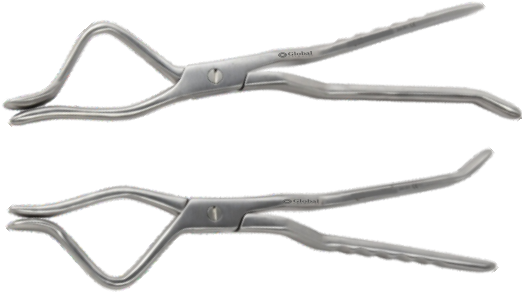
Rowe Maxillary Disimpaction Forceps