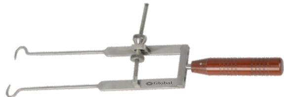
Fibula Holding Forceps