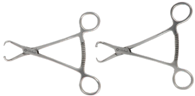
Bone & Plate Holding Forceps - Guarded Point Right & Left in Pair