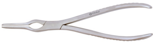
Asch Nasal Septum Forceps